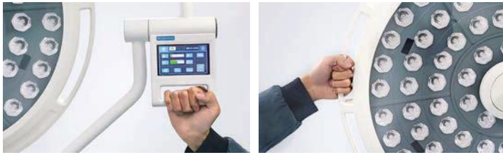
Ergonomic handle for easy light positions.