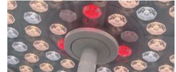
Red light for R9 to distinguish the different red tissues in the body