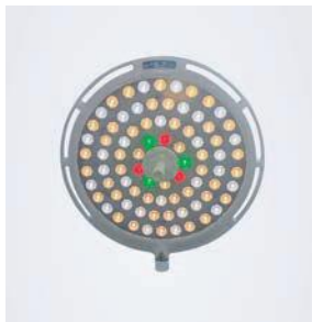
Big lamp diameter 700mm with 81 OSRAM LED bulbs