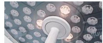
Endoscopy(MIS) surgery mode