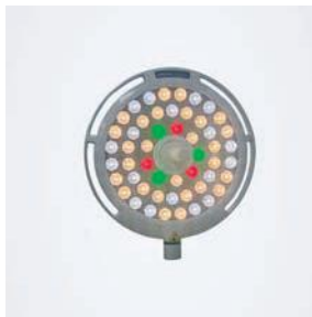
Small lamp diameter 500mm with 51 OSRAM LED bulbs