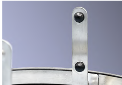
Anti-slip fixing points

Anti-slip rubber bumper ring to protect the walls.