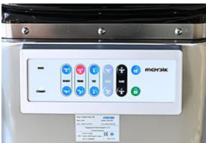
Column control system