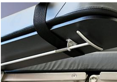
Armrest adjustment device

Angle of armrest adjusted via gas spring