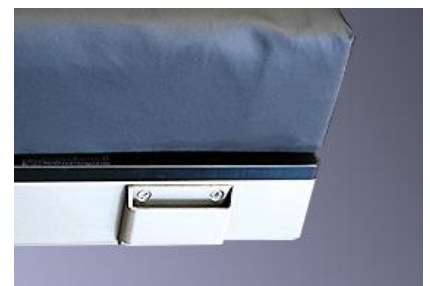
Hand remote hanger

Moves via 4 castors, stable and does not shake after locking