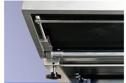
Head section adjustment device

Legs are adjustable via knobs and gas springs