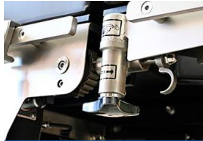
Leg section adjustment device

built-in kidney bridge, can be adjusted up to 120mm through the crank