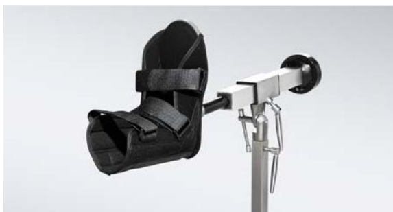
Foot Adjustment Device

The foot section can be adjusted in multiple angles and distance, as well as the height, allowing doctors to easily fix the patient in the best surgical position.