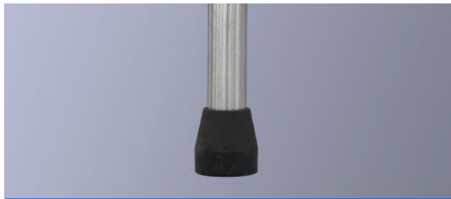
Reinforced rubber feet

The pedal surface adopts a concave-convex pattern design, which has an anti-slip function.